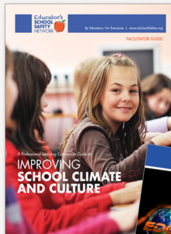
Climate and Culture Professional Learning Community Guide